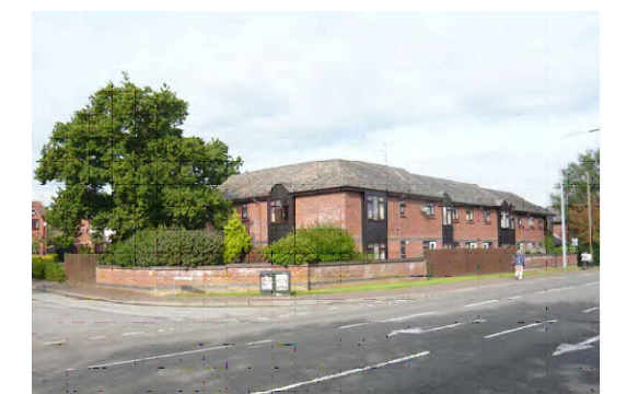
Dwellings at Ashdown Close