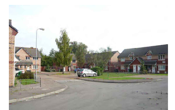
Dwellings at Wakehurst Place